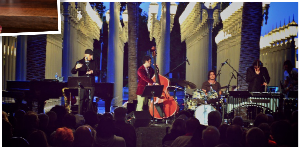
Pictured right: Evening of Jazz at LACMA

“The LACMA has inspired many wonderful memories for my entire family throughout the years. I have enrolled my kids in various art classes offered through the education program, perused the Pavilion for Japanese Art, and enjoyed Jazz on Friday nights in the Courtyard. Two of my favorite LACMA exhibits were the fabulously curated Modigliani & the Artists of Montparnasse and From the Spoon to the City: Objects by Architects. While on a flawless evening a few years back, I attended the most riveting opening gala for BCAM at LACMA, which could not have been more beautiful or impressive.”